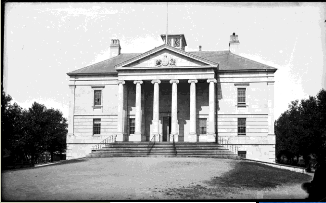
Colonial Building 1850-1959