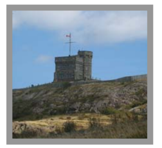
Signal Hill