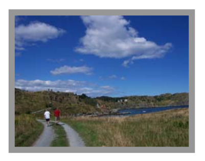
The Shoreline Walk - Bay Roberts