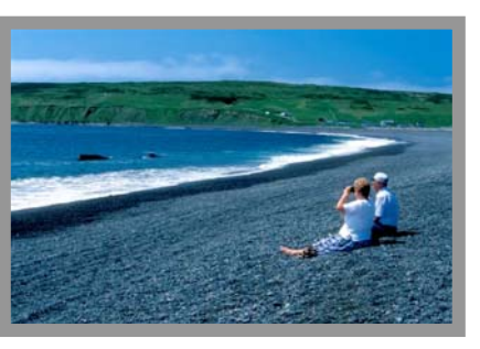
St. Vincent's Beach