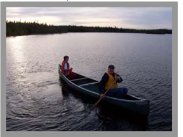
Canoeing at Juniper Lake