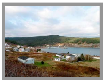
Cape Broyle