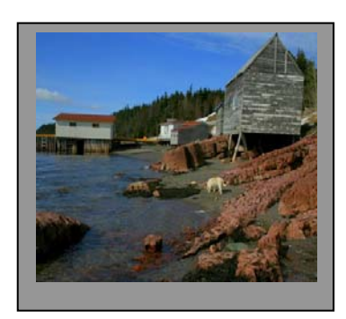
Foster's Point, Trinity Bay