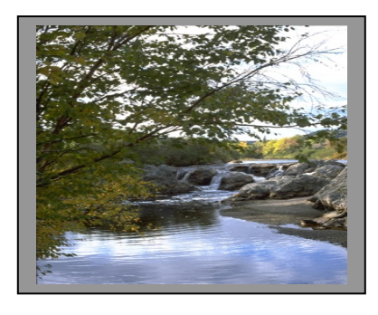
Clarenville River