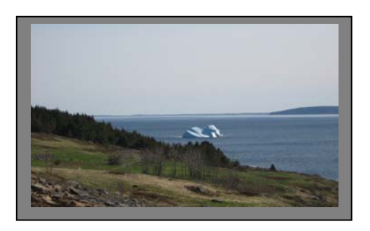
Iceberg, near King's Cove