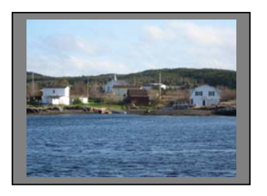
North Harbour, Placentia Bay