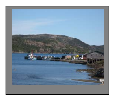
Princeton, Bonavista Bay