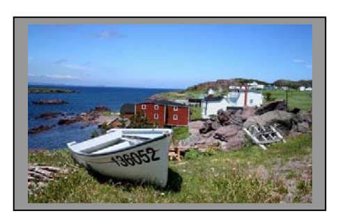
Open Hall, Bonavista Bay