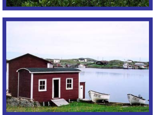
2006-07 Annual Activity Report Rural Secretariat