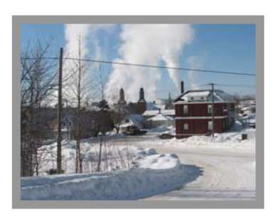
Grand Falls-Windsor