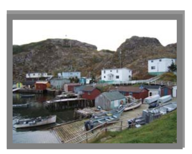
McCallum Photo Compliments of Roberta Collier