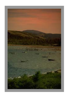
Davis Inlet