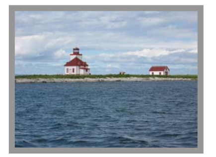
Flower's Island Lighthouse