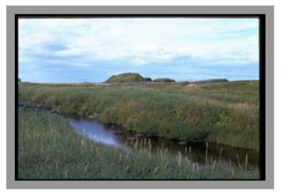
L'anse aux Meadows