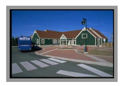
Grenfell Interpretation Centre, St. Anthony