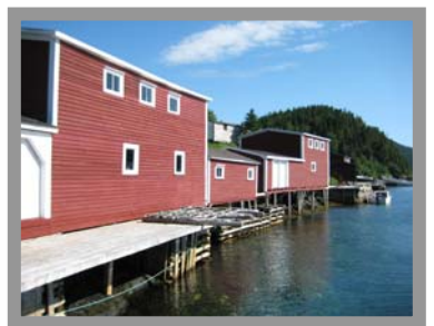
Croque Waterfront