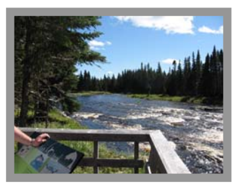
Beaver Brook