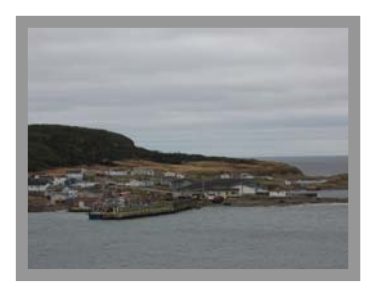
Conche Harbour