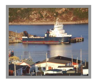
Ramea ferry – Gallipoli