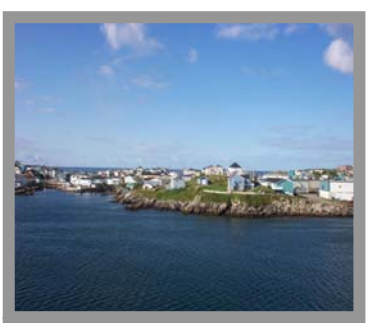
Port aux Basques