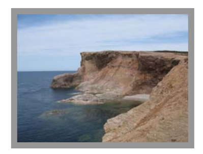
Boutte du Cap (The Boot) at Cape St. George